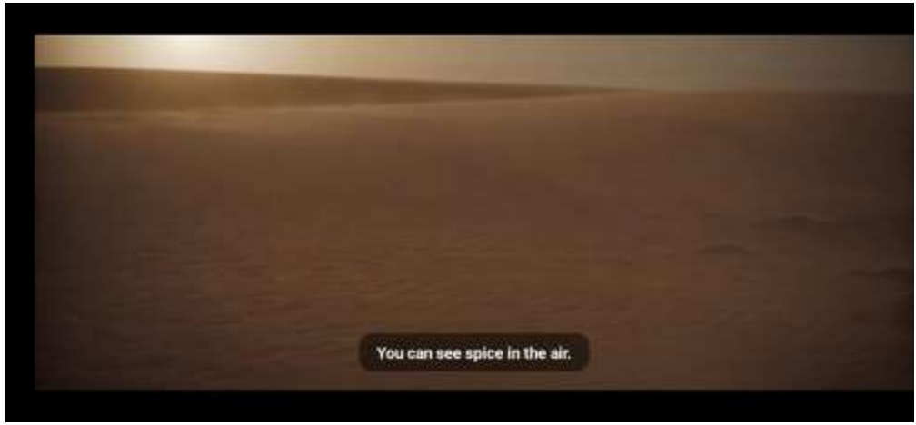
Fig 1. Arrakis Planet (Dune)

The portrayal of Fremen attacks making spice harvesting extremely hazardous highlights the negative impact of such economic activities on the environment. Additionally, the movie reveals contrasting views on spice between the Fremen and the Imperium. For the Fremen, spice is a sacred hallucinogen that sustains life and provides significant health benefits. However, for the Imperium, spice is used by navigators of the spacing guild to find safe paths between the stars. Without spice, interstellar travel is impossible, emphasizing its status as the most valuable substance in the universe. Although spice holds significant cultural and medical value for the Fremen, its commodification by the Imperium leads to environmental exploitation on Arrakis. This exploitation may include the use of damaging agricultural techniques or destruction of natural habitats to increase spice production. This shows how spice commodification in the movie Dune contributes to environmental exploitation on Arrakis by portraying differing perspectives on the value and use of spice, ultimately reinforcing the drive to overexploit natural resources and damage the environment.