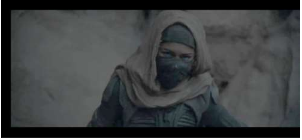
Fig. 2 The Fremen of Arrakis

The movie also reveals the bitter experiences of the Fremen in facing inhumane treatment by foreign entities dominating the spice harvesting on Arrakis. This reflects deeper issues regarding the cultural marginalization of the Fremen, where they are not only overlooked in decision-making regarding the management of their natural resources but also subjected to cruel and unfair treatment. According to Hellen Tiffin and Huggan's theory, this portrayal exemplifies the cultural marginalization experienced by indigenous communities under colonial domination. The Fremen, despite their rightful claim to Arrakis and their deep connection to its ecology, are marginalized and deprived of agency in decisions impacting their livelihoods. This dynamic illustrates the enduring legacy of colonialism, where indigenous cultures are disregarded and oppressed for the benefit of external powers. This shows how the commodification of spice not only contributes to environmental exploitation on Arrakis but also reflects broader issues of social and cultural injustice experienced by the Fremen.